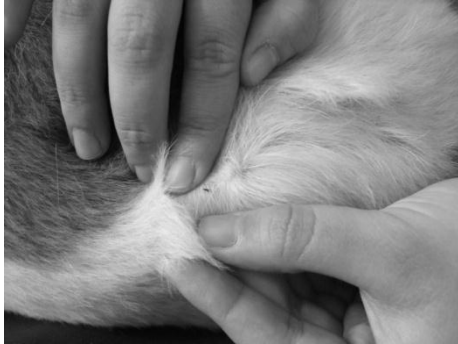
Figure 1 – Cat flea