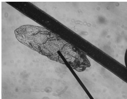
Figure 5 – Trichodectes canis larve (x20)