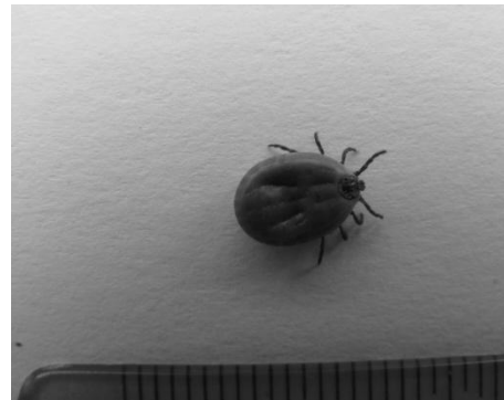
Figure 4 – Dermacentor marginatus female after feeding