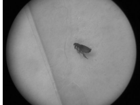
Figure 2 – Ctenocephalides felis