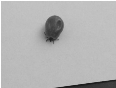
Figure 3 – Rhipicephalus sanguineus female after feeding