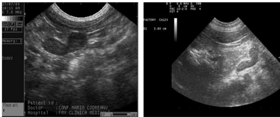
Figures 1 - 2. Diffuse adrenomegaly - normal echostructure

Ultrasound reveals in case of affected adrenal glands appears as distinct structures, flattened shape, appearance lobe, located cranio-medial kidney, caudal of the mesenteric and celiac artery and cranial of the renal artery and the right (lower) prior to renal vein and cranial right kidney (Figures 1-6). In Cushing syndrome the most important ultrasound changes were represented by diffuse bilateral in 68.75% (Figures 1-4), unilateral (18.75%) adrenomegaly and local ultrasonographic changes of irregular shape, different echostructure and echogenicity in 12.5%, of nodular aspect (Figures 5-6).