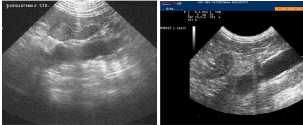
Figures 5 - 6. Nodular changes of different echostructure and echogenicity