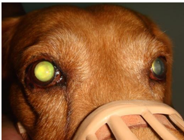
Figure 4. Progressive retinal atrophy in a dog (mydriasis, hyperreflectivity of the tapetum lucidum)

Glaucoma affects both the retina and the optic nerve. The patients had increased intraocular pressure ( >20 mmHg), mydriasis and no PLR. In one case, the only clinical signs were increased intraocular pressure (27-30 mmHg) and mydriasis. Using CPR was crucial because it indicated an ophthalmological disease, specifically a retinal damage: the photoreceptor-mediated CPR (red light stimuli) was absent, while melanopsin-mediated CPR (blue light stimuli) was slightly decreased or with pupillary escape, indicating that it was not an inner retina or CNS disorder. An ultrasound was performed and the final diagnosis was retinal detachment with secondary glaucoma.