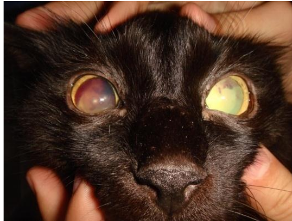
Figure 3. Retinal detachment in a cat – bilateral mydriasis

Due to the photoreceptor (outer segments) damage, the photoreceptor-mediated pupil light response (red light) is usually absent, while melanopsin-mediated response (blue light) is present or decreased. Retinal detachment older than 1 month sometimes resulted in the complete loss of the red response and incomplete blue response.