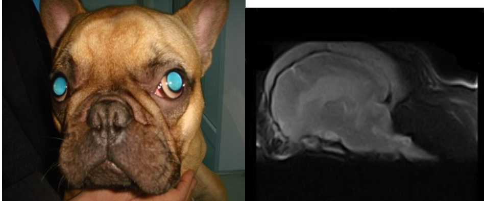
Figure 5. 1 year old dog with bilateral mydriasis, blindness, with no other neurological/ophthalmological signs. RMN: optic chiasm hemorrhages