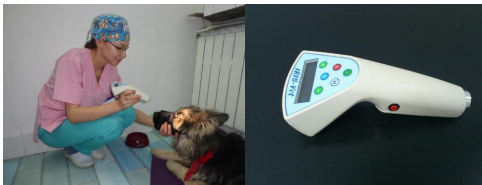
Figure 1. The IRIS VET device

characterized by powerful light sources with very precise light intensity output ( 200 \text{ kcd/ m}^2 ) and very precise wave lengths (ultra-bright red diode source – 630 nm; ultra-bright blue light diode source – 480 nm), which can be used to elicit different spectral components of the pupil light reflex (Figure 1).