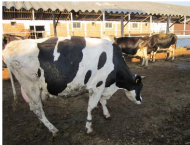
Figure 5. Camping forward and camping back

Thus in acute laminitis the cow can protract the hind limbs (camping forward), and the forelimbs are retracted under its body (camping back) – Figure 5.