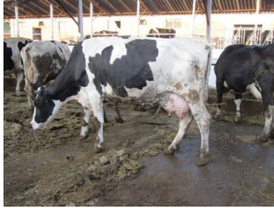
Figure 2. Cow swings its limb away from the body

The gait with the sick limb is hesitant, as it is out of support, and the back is arched more or less, according to the intensity of the pain. (Figure 3)