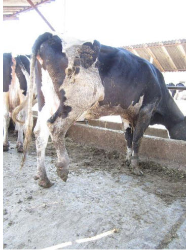
Figure 9. Hanging leg lameness is a reaction to extreme pain

Hanging leg lameness is a reaction to extreme pain as would occur from septic arthritis of the pedal joint or a fractured pedal bone (Figure 9).