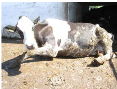
Figure 1. Cow prefers decubitus

A lame cow prefers decubitus (Figure1), and when a cow swings its limb away from the body it is attempting to relieve pain in the outside claw (Figure 2).