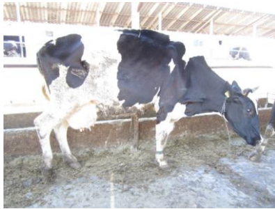
Figure 3. Hesitant gait and arched back

The gait with the sick limb is hesitant, as it is out of support, and the back is arched more or less, according to the intensity of the pain. (Figure 3)