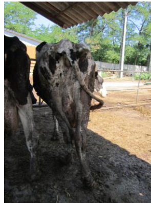
Figure 10. Walking narrow

If an animal stands or walks with its feet close together it is „walking narrow.” This is often the sign of the seat of lameness being located in the inside (medial) claw. Cattle with subclinical laminitis mainly in the medial claws will walk narrow. (Figure 10)