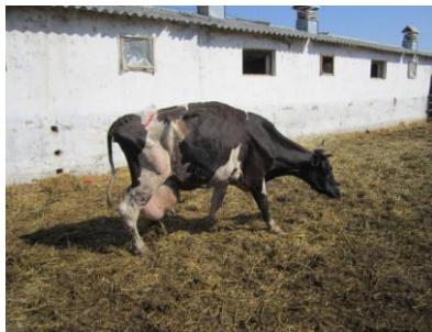
Figure 7. A lame cow will hold its head lower than normal

A lame cow will hold its head lower than normal, will spend less time in bearing the weight on the affected limb and the stride will be shorter. (Figure 7).