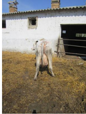
Figure 6. The pain in the heel bulbs

A lame cow will hold its head lower than normal, will spend less time in bearing the weight on the affected limb and the stride will be shorter. (Figure 7).