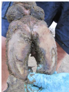
Figure 4. Examination of claws

Determining the seat of lameness and its nature has required the systematic exam of all the anatomical components of the sick limb, starting with the emergence with the body and finishing with the examination of claws. (Figure 4)