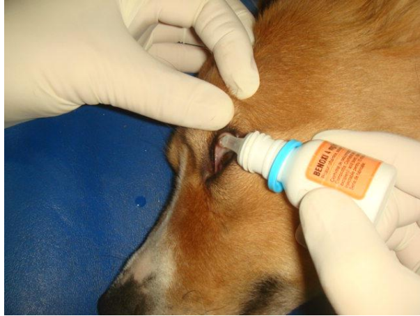
Figure 3. Topical eye anesthetics such as Benoxycaine.