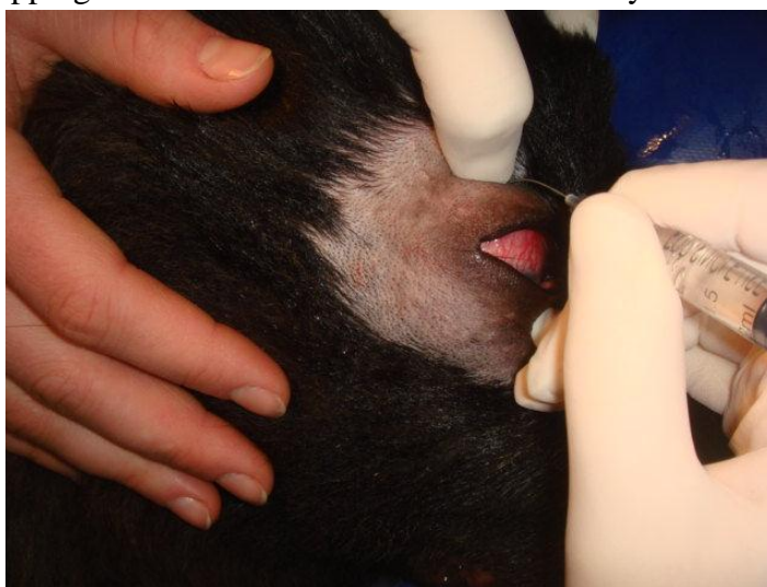
Figure 2. Retrobulbar block by palpating the superior orbital rim