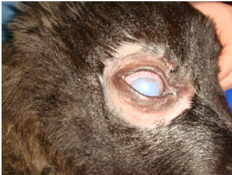
Figure 1. Buphtalmia before retrobulbar block

The animals that have been used for the study and proposed for enucleation were examined at Faculty of Veterinary Medicine, Department of Ophthalmology, both dogs and cats developing clinical conditions such as: glaucoma and buphtalmia (Figure 1), penetrating corneal wounds with lack of substance, descemetocoele, avulsion of the eyeball, intracameral neoplasms, uveitis and phthisis bulbi, especially encountered in viral feline rinotracheitis, etc. Contraindications for this technique were: inflammation, retrobulbar processes or abscesses.