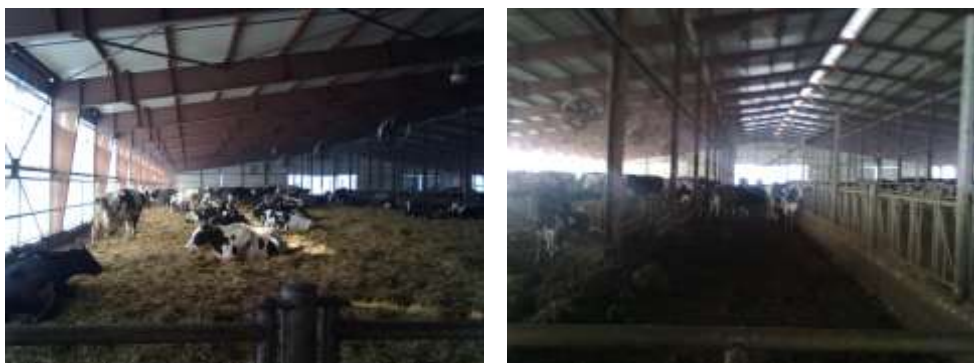
Figure 1. Different aspects from one of the studied houses for dairy cows Left: deep bedding area, Right: walking, feeding and manure collection area

The general score for the first area of influence was 6 points.