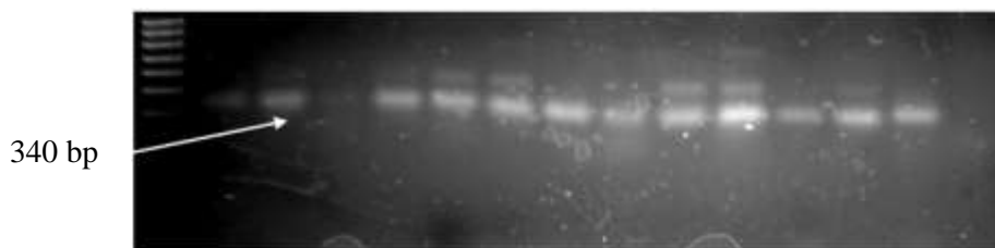
Figure 2: The electrophoresis profile of the 340 bp fragment corresponding to E.coli

Along the E.coli strains identified we had samples where we found Streptococcus spp. associated with Klebsiella pneumoniae . In the samples harvested from the small unit "B" in 16 of them there were identified germs belonging to Staphylococcus genre. With the help of Walkaway system it was confirmed with a certainty of 85% that the strain identified was Staphylococcus aureus in 3 of the samples tested (18%). The rest of the positive samples belonged to S. chromogenes (44%), S. Intermedius (22%), S. Wernerii (16%).