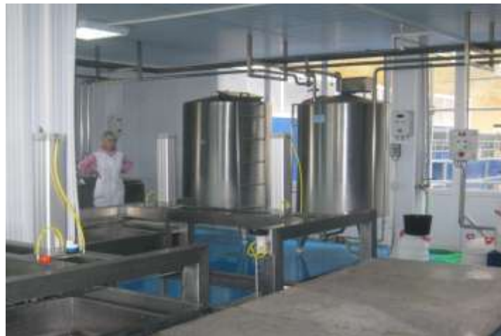
Figure 3. Teaching in a milk processing unit

The stages of this method are: presentation of the case (clear, accurate, complete); clarify the possible misunderstandings; individual case study (students are documenting, they identify solutions to solve the case and complete the observation worksheet); the possible diagnoses are discussed in group ( is made the differential diagnose), it takes a decision regarding the suitable solution ( diagnosis and treatment); the solutions are evaluated with the students (Oprea, 2006).