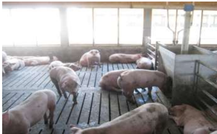
Figure 2. Teaching in a pig farm

The method is carried out in several stages: preliminary stage comprising three phases (phase of organizing, creative training and preparation phase of the session, the second stage of issue of creative alternatives by fixing the case, the problems to debate and by solving subproblems through issuance of ideas; the third stage which aims the issued selection ideas – the list of ideas is analyzed and they opt for the final solution (diagnosis and treatment).