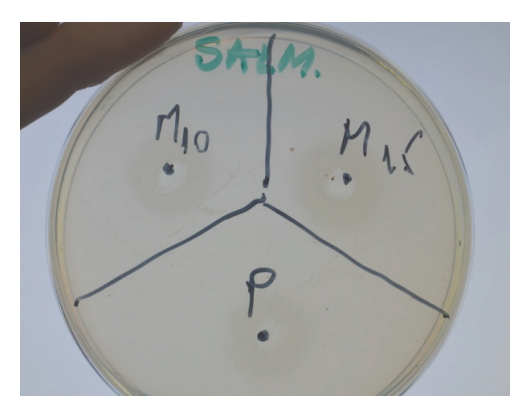
Figure 3. The antimicrobial activity of three types of honey: UMF10 Manuka honey (M<sub>10</sub>), UMF15 Manuka honey (M<sub>15</sub>) and polyfloral honey (P), against Salmonella sp

Manv authors communicated noticeable antimicrobial effect of Manuka honey against various pathogens, but there are insufficient studies comparing different UMF Manuka honeys, amongst each other as well as with other types of honey, in terms of antimicrobial activity. Similar marked differences of antimicrobial activity intensity between Manuka honey and other types of honey were also communicated by other authors, such as Willix (1992), or Sherlock (2010).