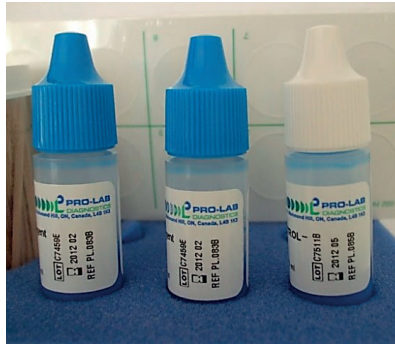
Figure 1. PROLEX STAPH LATEX KIT

The principle of this test consists in agglutination of the mixture made by the staphylococci strains producing bound coagulase (clumping factor) and the latex particles sensitized with fibrinogen and IgG of the kit. Thus, on the test card, was dispensed one drop of each of the two vials, respectively reagent 1 containing blue polystyrene latex particles sensitized with human fibrinogen and immunoglobulins and reagent 2 containing white unsensitized latex particles (control). In every drop of the two reagents was dispensed with a bacteriological loop, one or two young (18-20 h) suspect culture and homogenized until the appearance of small clots indicating the presence of bound coagulase.