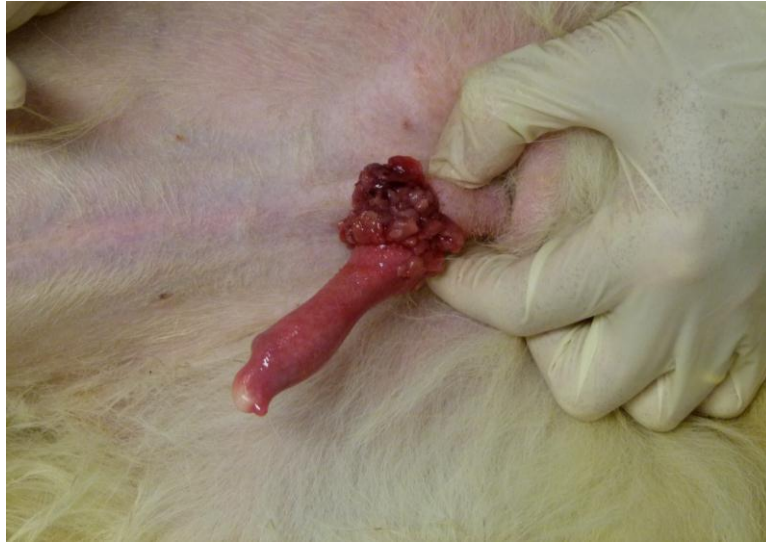
Figure 2. Sticker tumor at a 10 years old Samoyed male (orig.)