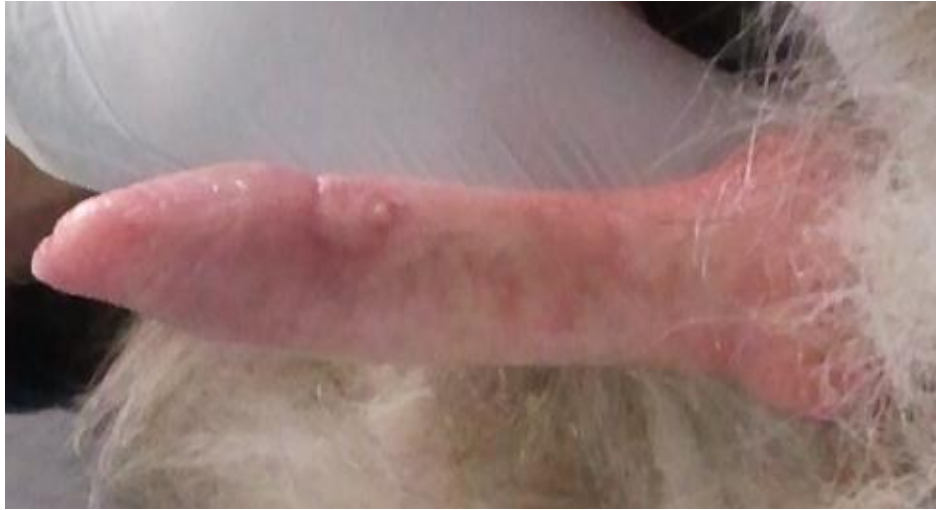
Figure 6. Sticker tumor remission at a 10 years old Samoyed male after treatment using polychemotherapy - detail (orig.)