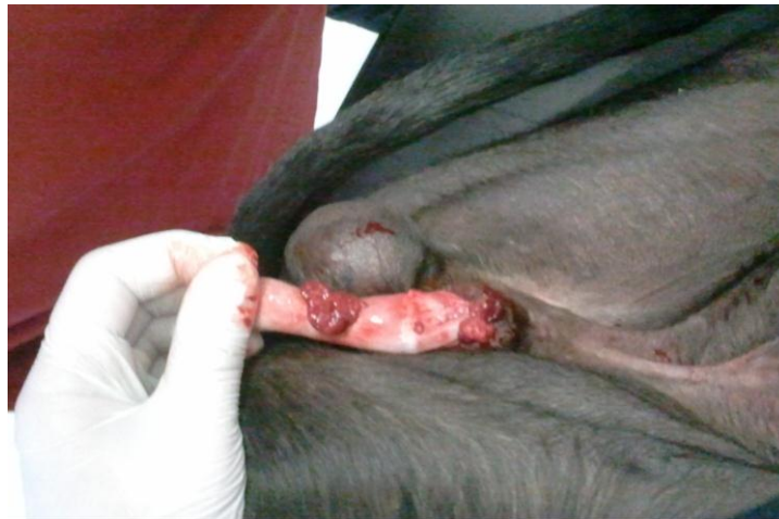
Figure 1. Sticker tumor at a 5 years old English Greyhound male (orig.)