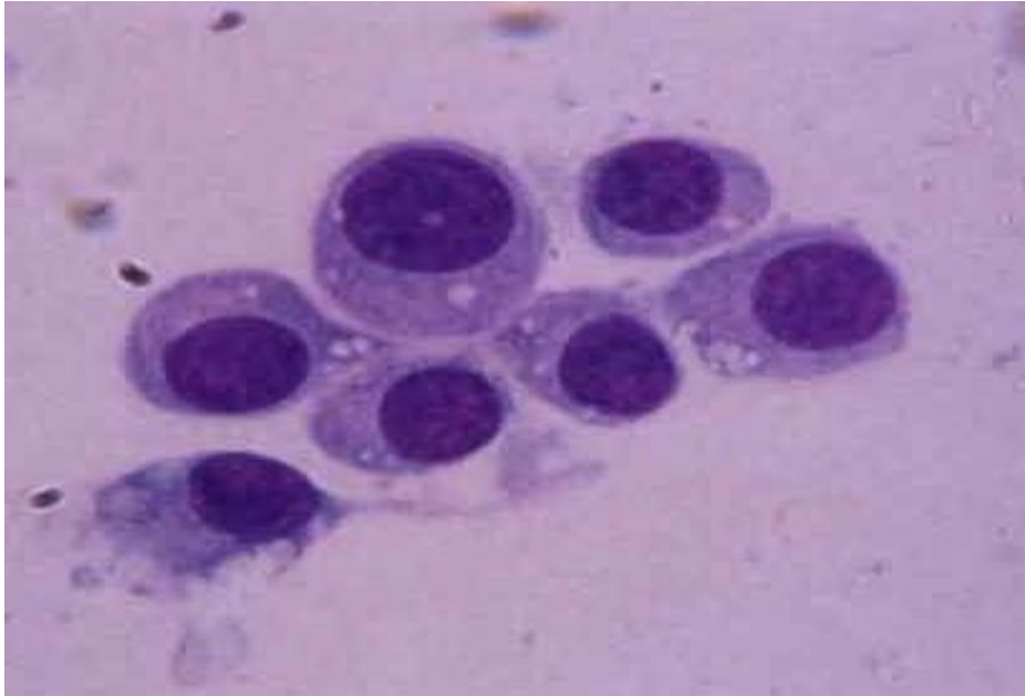
Figure 4. TVT round or slightly polyedric cells, with thin cytoplasm in which vacuoles and a round, hyperchromic nucleus with a single nucleolus and a low number of mitotic elements are visible (orig.)